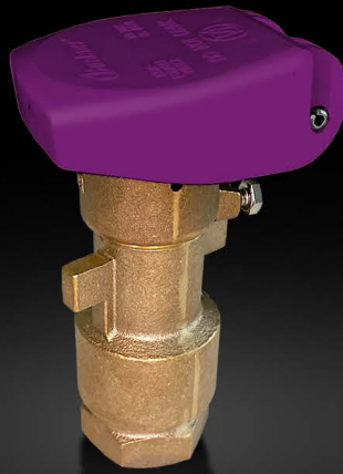
QB 2 Piece Series