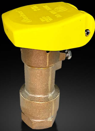
QB 1 Piece Series